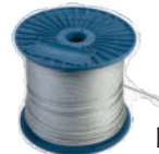
Sajla DIN 3055