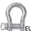
ŠKOPAC EURO OMEGA