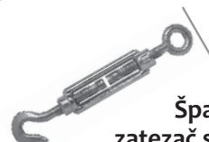
Španer zatezač sajle